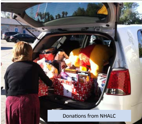
Donations from NHALC