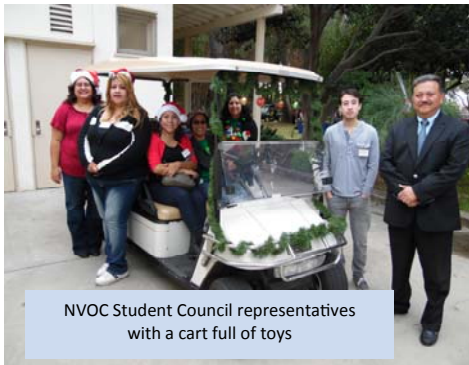
NVOC Student Council representatives with a cart full of toys

The Toy Drive was a great success and your generous donations helped to brighten the Holidays for children in need. NVSA appreciates all our Student Council does to help organize these successful events.